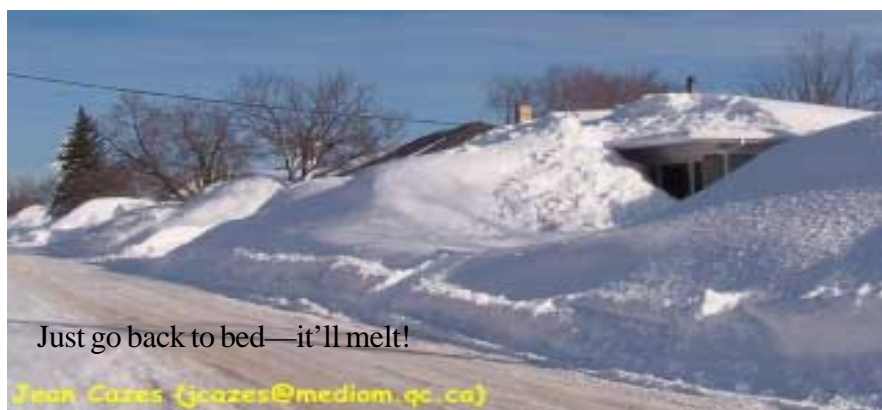
Just go back to bed—it'll melt!