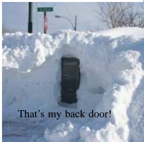
DIGGING OUT AFTER THE SNOWSTORM IN QUEBEC CITY, CANADA