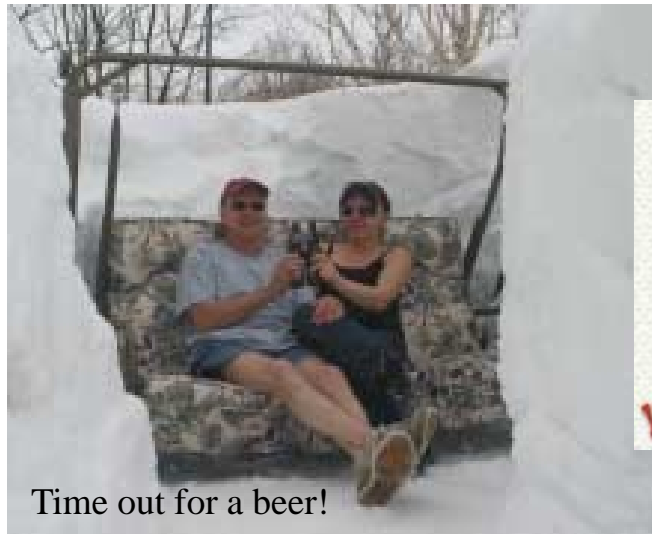
Time out for a beer!