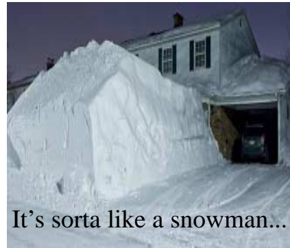
It's sorta like a snowman...