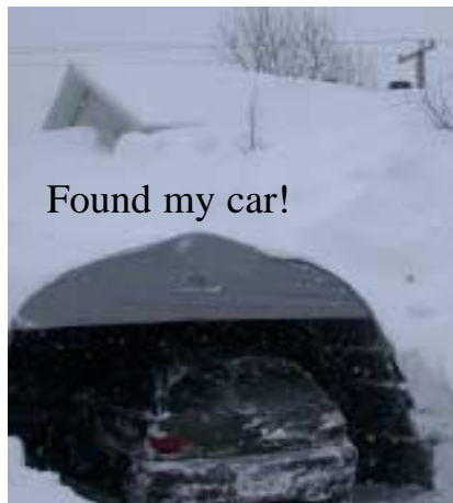
Found my car!