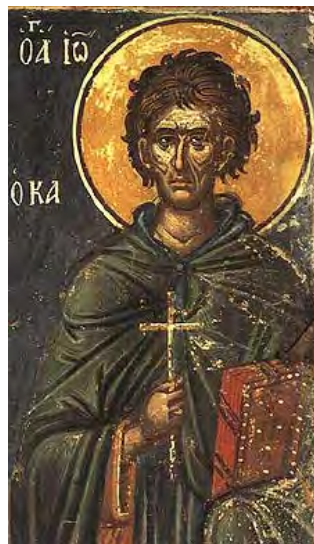
Venerable John Calabytes "the Hut-Dweller"