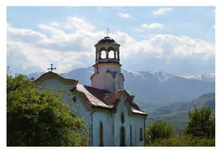
St. Theodosius Orthodox Cathedral Ambo - Page 6