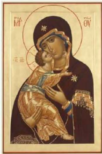
Theotokos of Vladimir