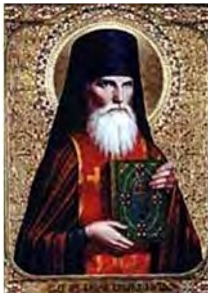
Venerable Alexei (Dec 2)