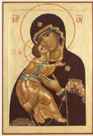
Theotokos of Vladimir