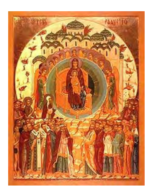
Synaxis of the Most Holy Mother of God