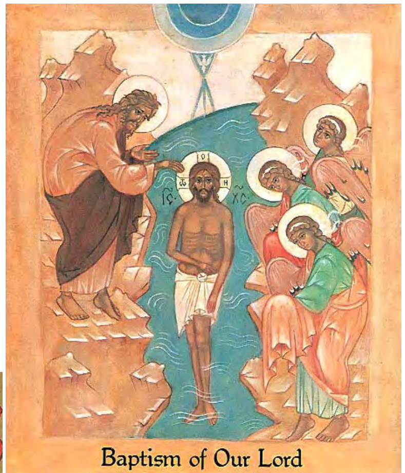
Baptism of Our Lord

The Royal Hours are read on Friday, but there is no Liturgy. Vigil is served on Saturday evening, and the Liturgy of Saint John Chrysostom is celebrated on Sunday.