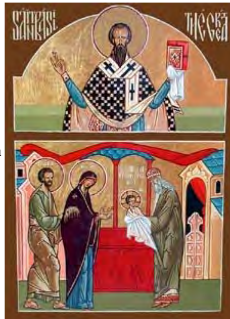
The Circumcision of our Lord and Savior Jesus Christ

Thursday, January 4 Forefeast of the Theophany Synaxis of the Seventy Apostles