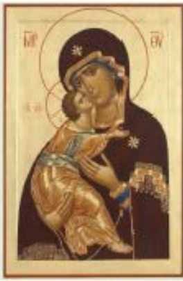
Theotokos of Vladimir