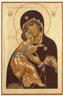
Theotokos of Vladimir