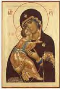
Theotokos of Vladimir