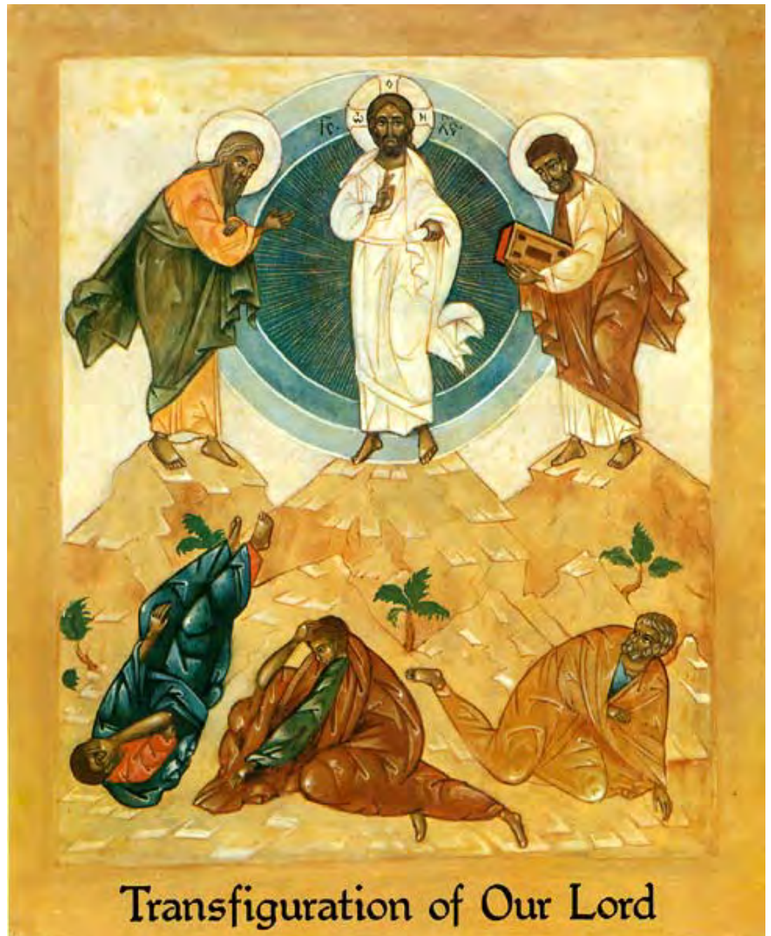
Transfiguration of Our Lord