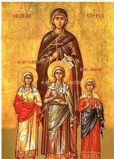
Martyr Sophia and her three daughters at Rome

Sunday, September 24 16th Sunday after Pentecost Holy New Martyrs of Alaska, Hieromonk Juvenaly (ca. 1796) and Peter the Aleut (1815) 8:40 AM 3rd and 6th Hours 9:00 AM Divine Liturgy Coffee Hour