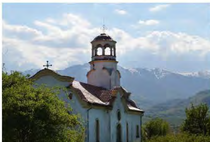
St. Theodosius Orthodox Cathedral Ambo - Page 6