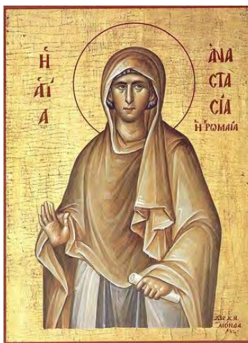
Monastic Martyr Anastasia of Rome