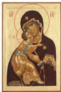
Theotokos of Vladimir