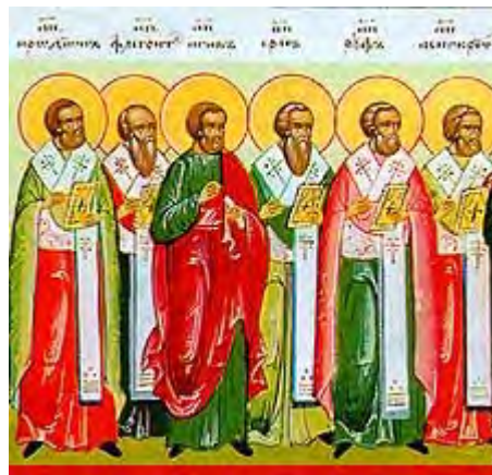
Apostle Herodion of the Seventy, and those with Him