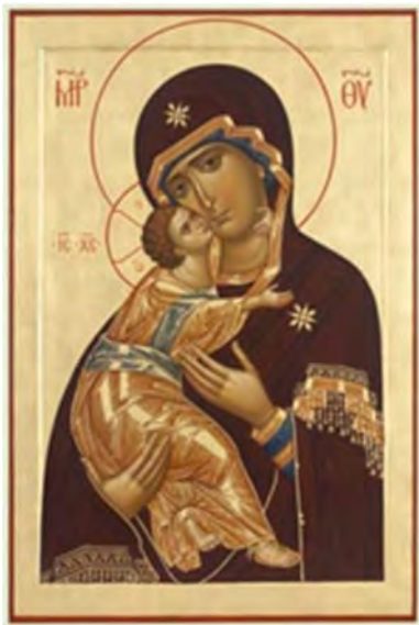
Theotokos of Vladimir