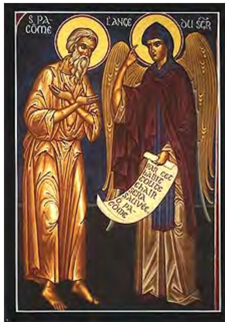
Venerable Pachomius the Great