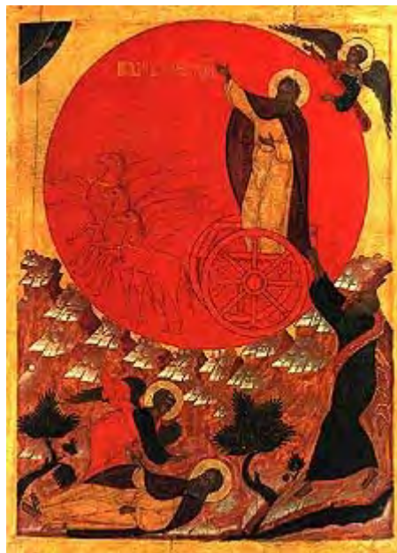
Elijah July 20th