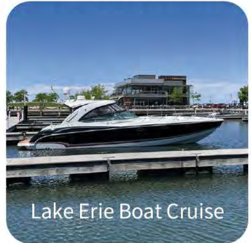
Lake Erie Boat Cruise