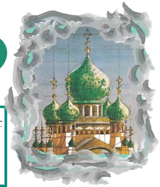
Entrance of the Virgin Mary in the Temple

ST. GREGORY, WONDERWORKER OF NEO-CÆSAREA