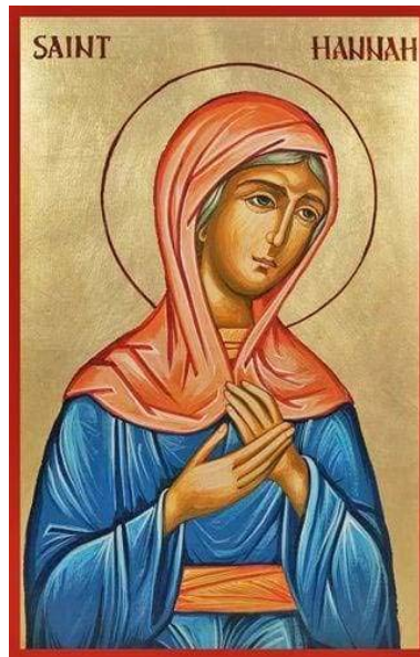
Prophetess Hannah the mother of the Prophet Samuel (December 9)

8:40 AM 3rd and 6th Hours 9:00 AM Divine Liturgy Coffee Hour