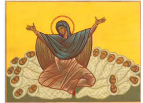
THE LAMENT OF RACHEL