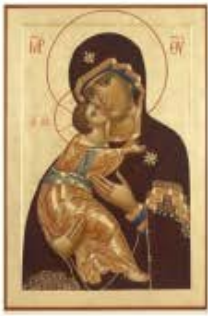
Theotokos of Vladimir