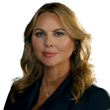
Lara Logan Saturday, March 14th

Registration is Now Open! bringingamericabacktolife.org